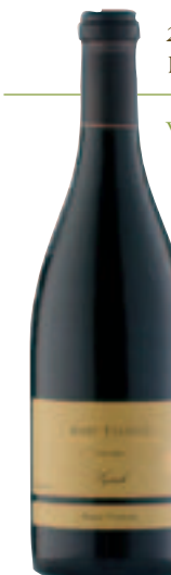
2008 SYRAH Ramal Vineyard, Carneros

Technical Notes Winemaker: Susan Reed Appellation: Russian River Valley Varietal: 100% Zinfandel Harvested: September 30, 2008 Bottled: December 10, 2009 Alcohol: 14.4% Acidity: 3.57 pH/74 gm/100ml