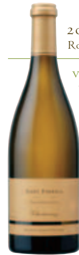
2008 CHARDONNAY Rochioli-Allen Vineyards, Russian River Valley