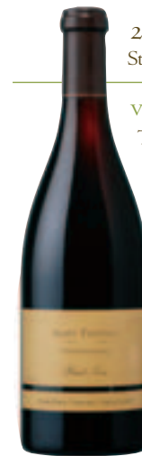
2008 PINOT NOIR Starr Ridge, Dijon Clones, Russian River Valley

Technical Notes Winemaker: Susan Reed Appellation: Russian River Valley Varietal: 100% Pinot Noir Harvested: August 23 to September 6, 2008 Bottled: December 8, 2009 Alcohol: 14.8% Acidity: 3.58 pH, .68 gm/100ml