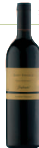
2008 ZINFANDEL Boschetti Vineyard, Russian River Valley

Technical Notes Winemaker: Susan Reed Appellation: Russian River Valley Varietal: 100% Pinot Noir Harvested: August 27, 2008 Bottled: July 25, 2009 Alcohol: 14.1% Acidity: 3.52 pH/.653 gm/100ml