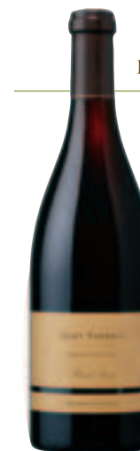
2008 PINOT NOIR Hallberg Vineyard, Russian River Valley